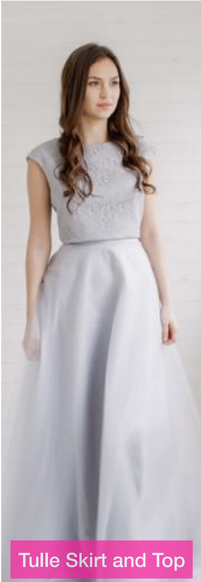
Tulle Skirt and Top